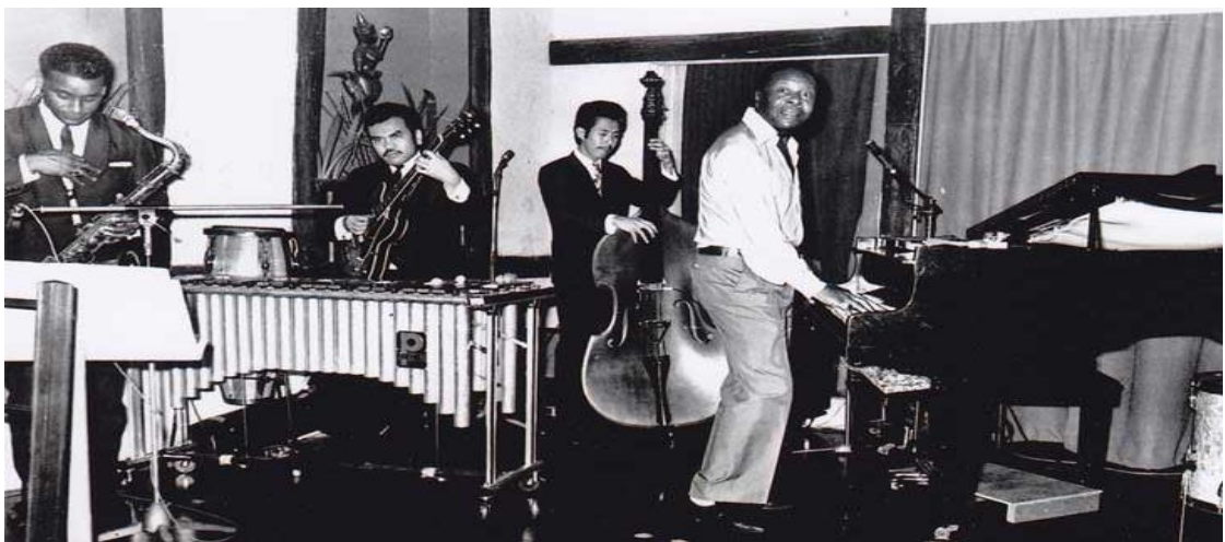
Bamboo Bar in the 1960's

All bottles come with unlimited premium mixers & ice. Additional bottles can be arranged subject to availability